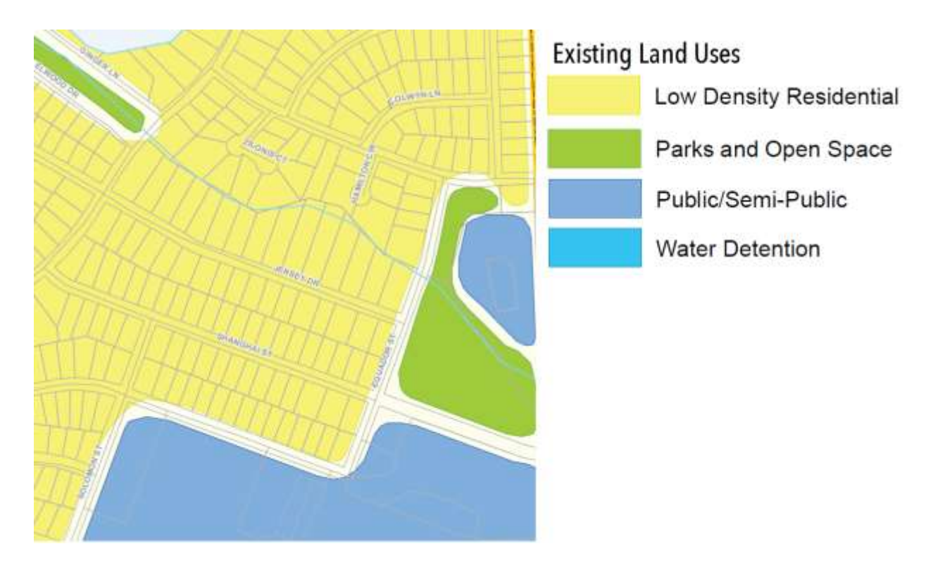
Map 3: The existing land use zoning within the TIRZ.