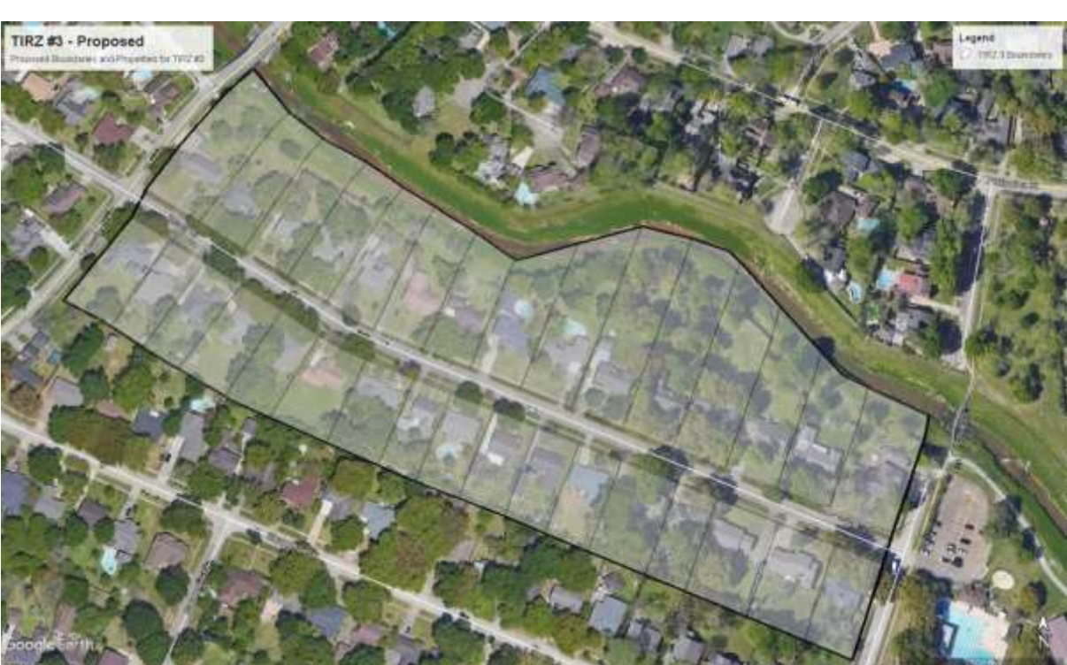
Map 1: Location of Proposed Tax Increment Reinvestment Zone

The proposed boundaries of the TIRZ are depicted below.